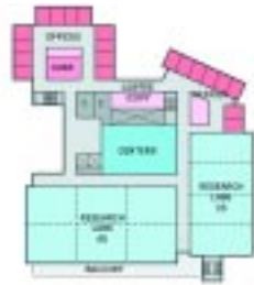
Fourth Floor and Fifth Floor