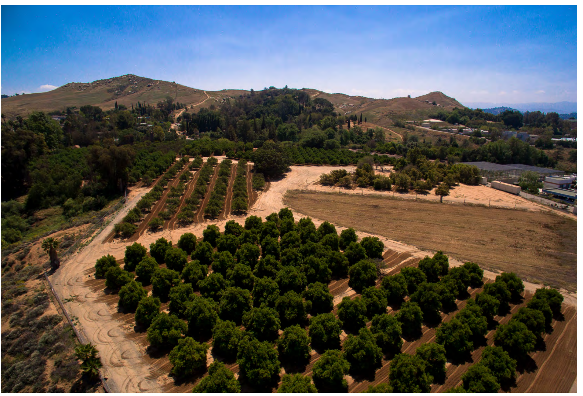
Riverside's climate is semi-arid, with highs in summer often well over 100 degrees Fahrenheit.