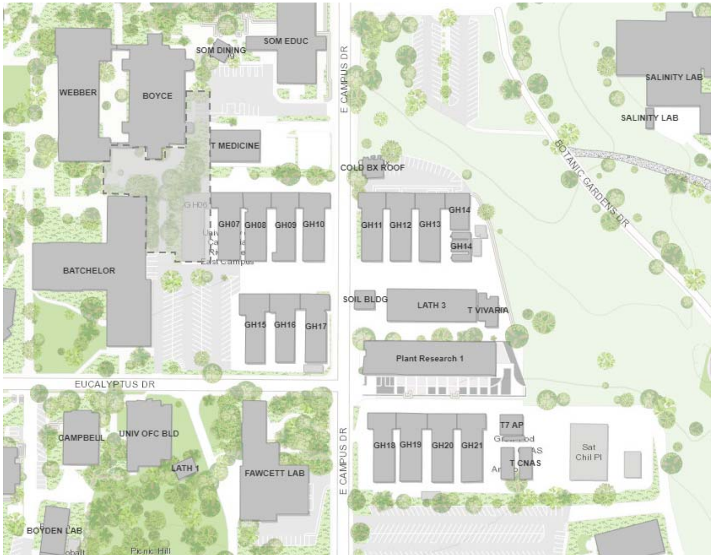
Greenhouses 7-21 Layout